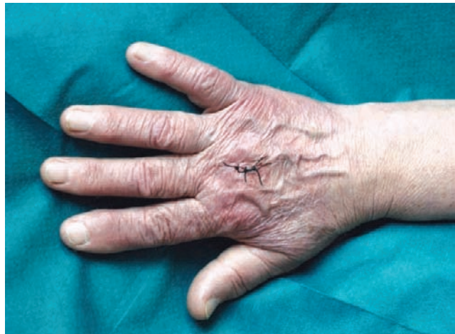
Figure 4. Illustrative example of a patient with acrodermatitis chronica atrophicans. The picture is a generous gift from Dr. Franc Strle (University Medical Center, Ljubljana, Slovenia).

1. Available data indicate that acrodermatitis chronica atrophicans may be treated with a 21-day course of the same antibiotics (doxycycline [B-II], amoxicillin [B-II], or cefuroxime axetil [B-III]) used to treat patients with erythema migrans (tables 2 and 3). A controlled study is warranted to compare oral with parenteral antibiotic therapy for the treatment of acrodermatitis chronica atrophicans.